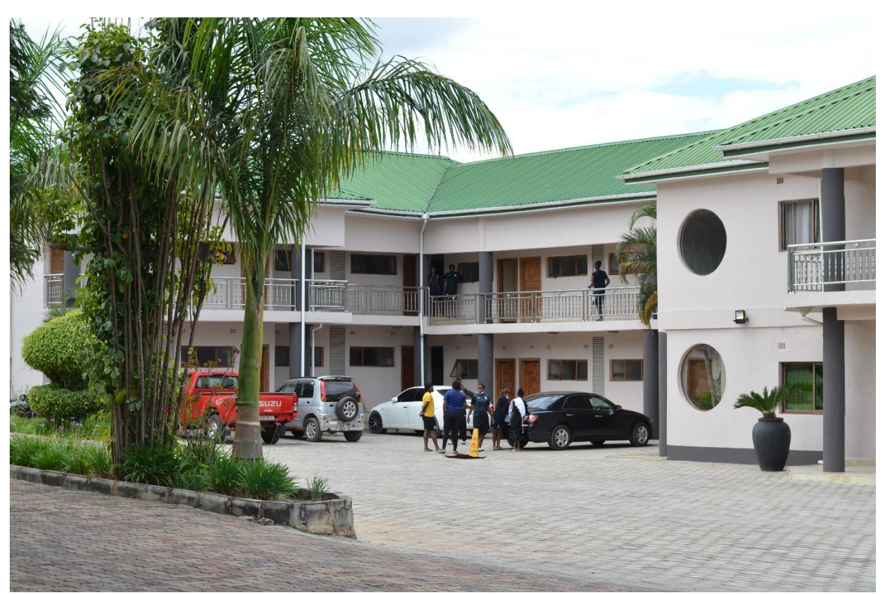
Day 1: Tecla Hotel / Lodge, Lusaka – 3 nights /4 Days

Tecla Hotel and Lodge are established, affordable and luxurious family run establishments located in Lusaka about 15minutes drive from Kenneth Kaunda International Airport. They offer some of the best value accommodation in the area and are conveniently located about 5 kilometres from the CBD. All rooms are air-conditioned, ensuite, with free Wi-Fi, DSTV, coffee and tea making facilities, fridge, swimming pool and manicured garden /playground. Clients have an option of staying either at Hotel or Lodge and still experience the same unforgettable hospitality.