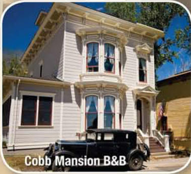
Cobb Mansion B&B

Call 800-496-9350 or visit us online for times and schedules.