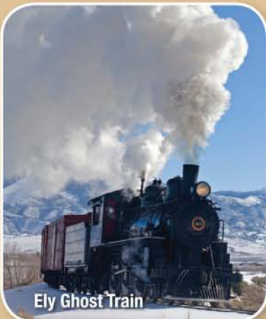
Ely Ghost Train

Day 1: Arrive in Reno where you will be escorted to your hotel or bed & breakfast in Virginia City. The evening will begin with a quick get acquainted tour of this historic town right out of the pages of Nevada's history books as well as the burning pages of Bonanza. You will have dinner at the Cobb Mansion Bed & Breakfast and after, you might enjoy a brandy, chocolate and maybe a cigar where Mark Twain wrote for the Territorial Enterprise.