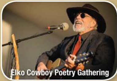
Elko Cowboy Poetry Gathering