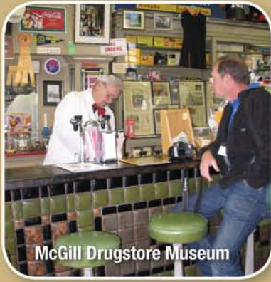
McGill Drugstore Museum