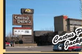
Cactus Pete's Jackpot