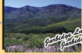
Jarbidge Lupines Jarbidge