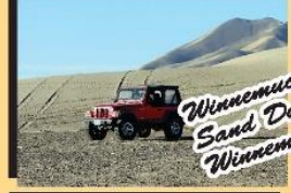
Winnemucca Sand Dunes Winnemucca