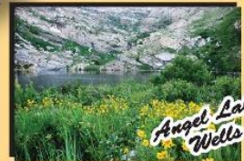
Angel Lake Wells