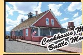
Cookhouse Museum Battle Mountain