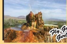
Fly Geyser Gerlach

For Information On Local Events visit our website at