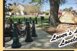
Lower's Lock Lovelock