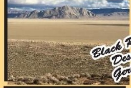
Black Rock Desert Gerlach