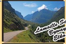
Lamoille Scenic Byway Elko