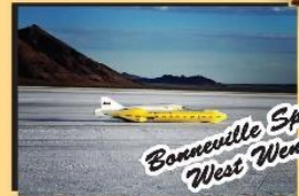
Bonneville Speedway West Wendover