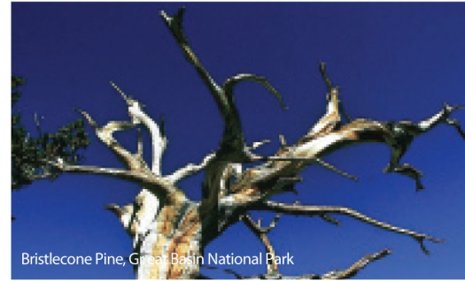
Bristlecone Pine, Great Basin National Park