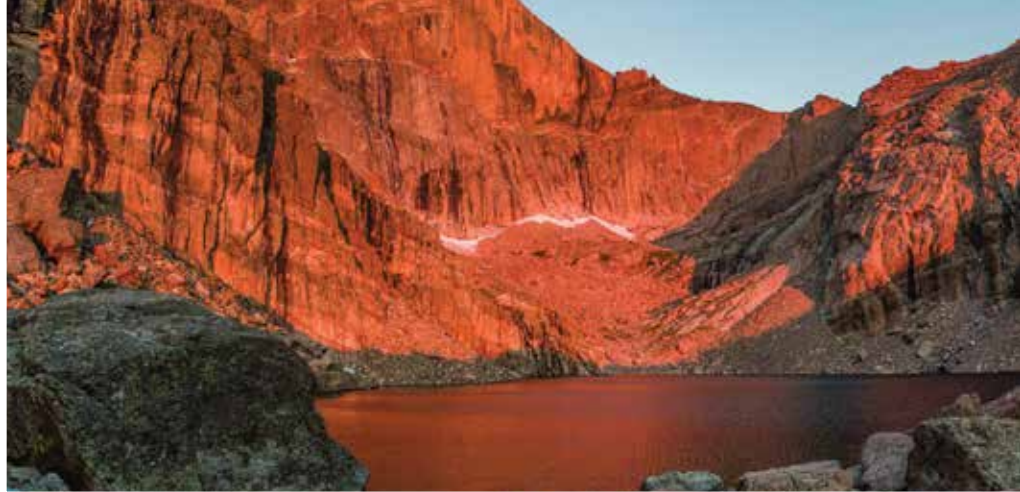
Rocky Mountain National Park