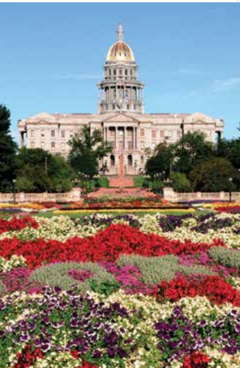
Denver Colorado State Capitol Building