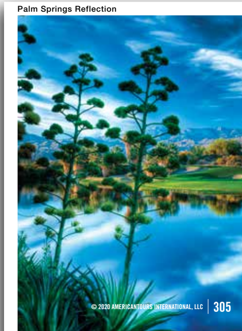
Palm Springs Reflection