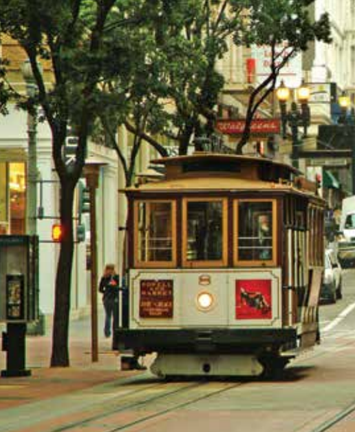
San Francisco Cable Car