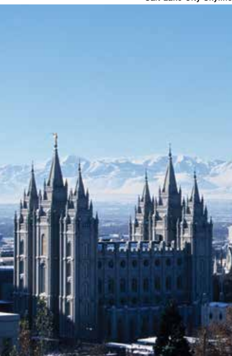
Salt Lake City Skyline