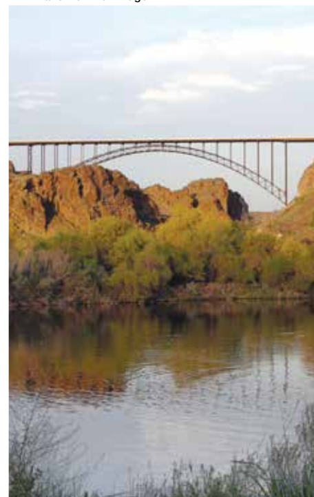
Twin Falls Perrine Bridge