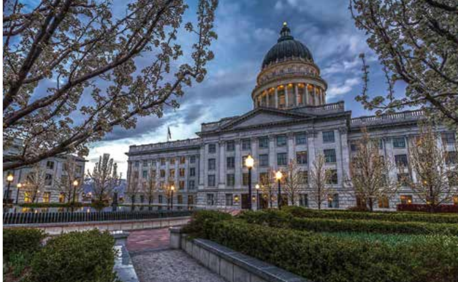
Salt Lake City Utah Capital