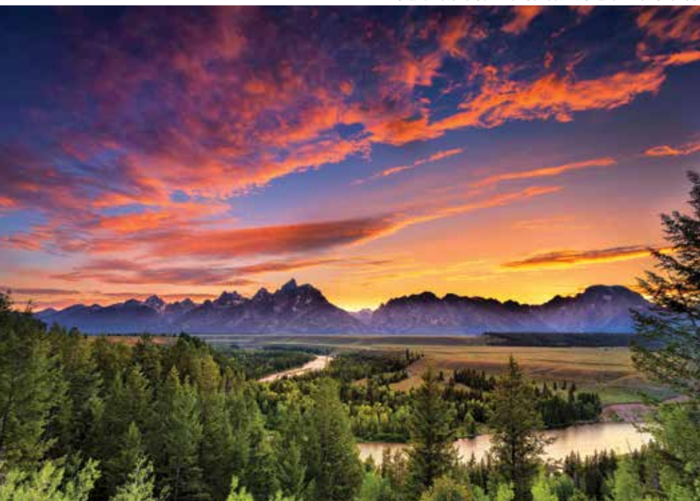
Grand Tetons Summer Sunset At Snake River Overlook