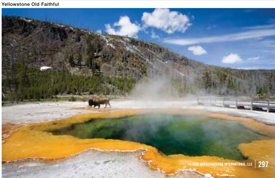
Yellowstone Old Faithful