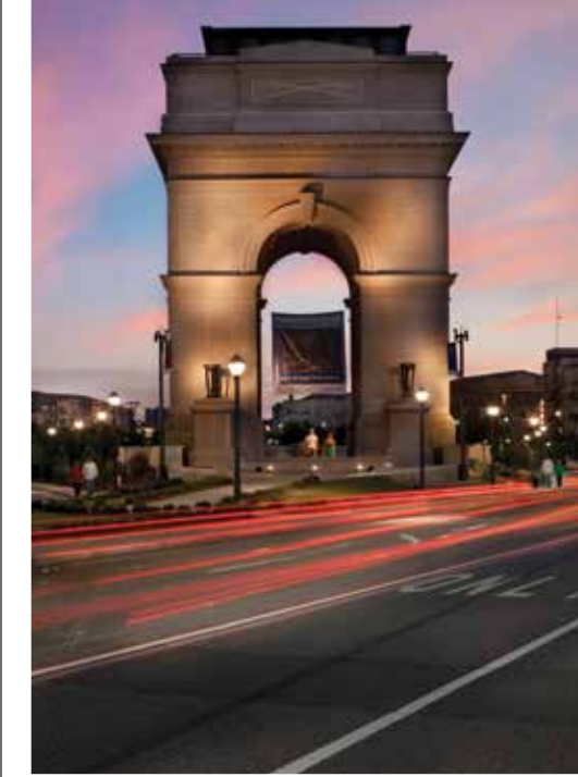
Atlanta Atlantic Station Arch