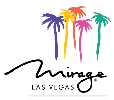
An MGM Resorts Luxury Destination

With tigers in the backyard, a volcano out front and luxury rooms, dining and amenities inside, The Mirage has transformed the modern Las Vegas experience. We'll always bring you the best in entertainment, dining, hotel luxury and nightlife.