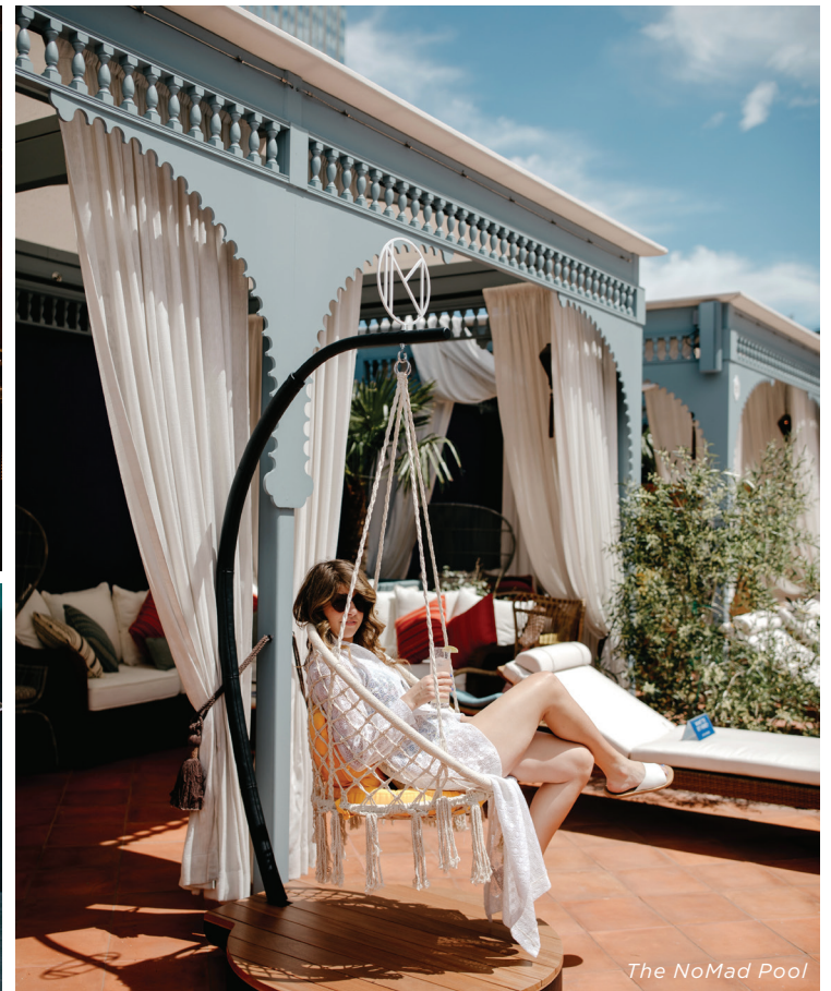
The NoMad Pool