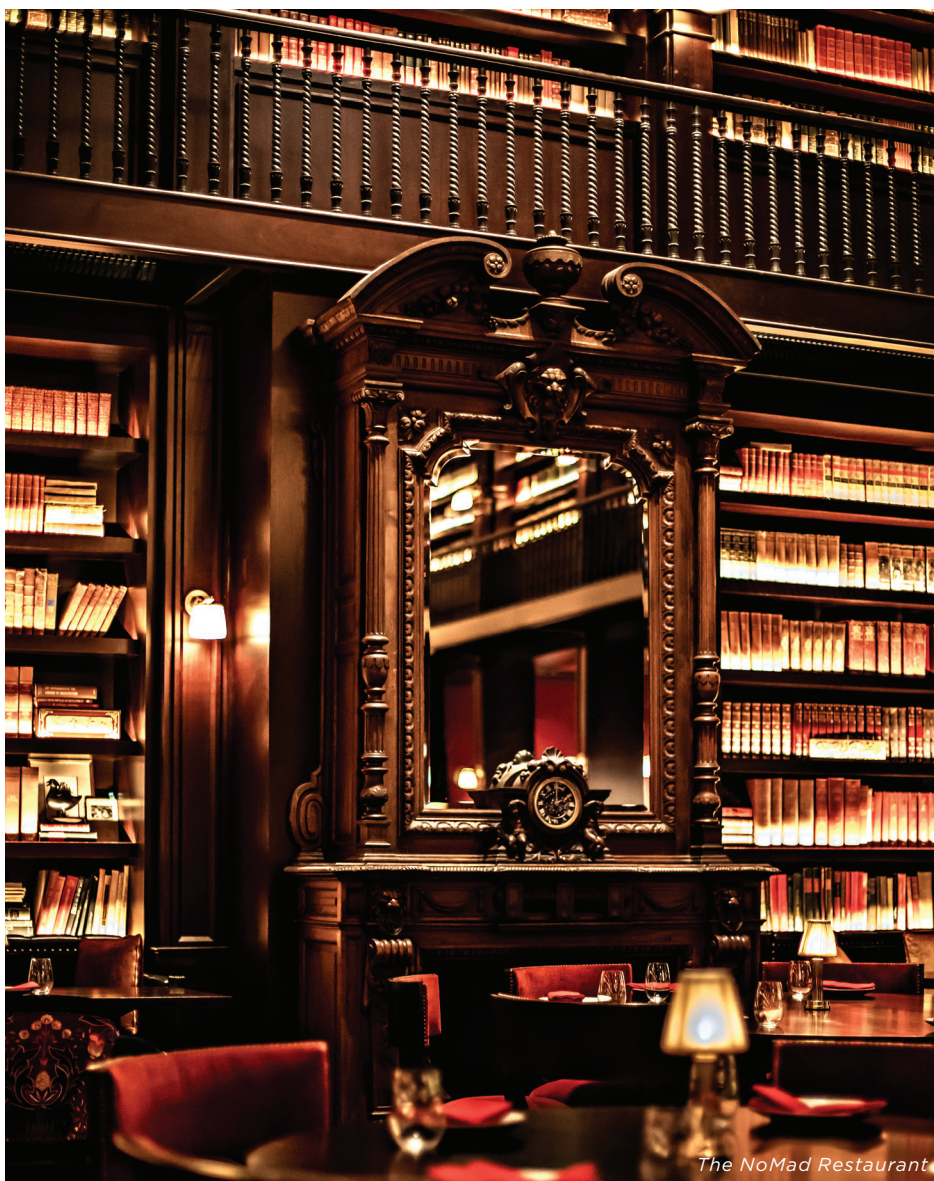
The NoMad Restaurant