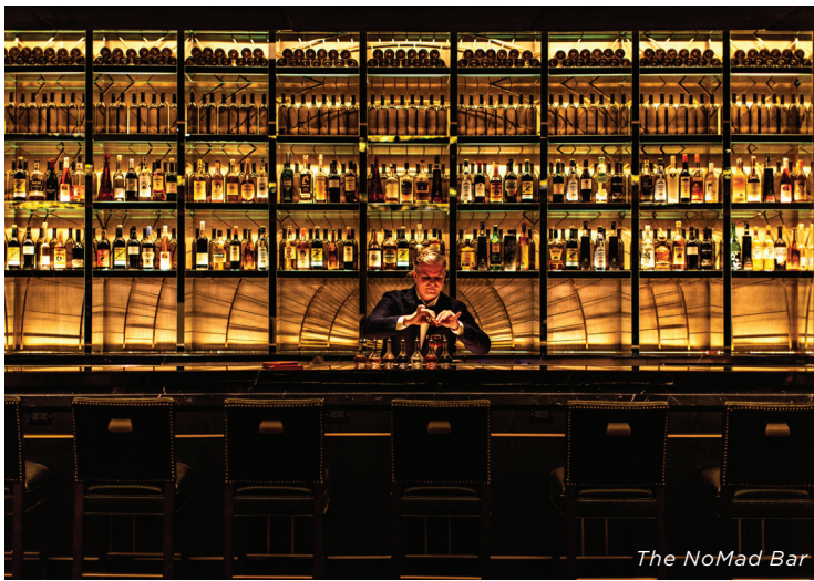
The NoMad Bar