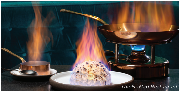
The NoMad Restaurant