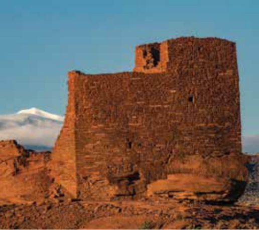
(Photo Credit: Flagstaff Arizona) Wupatki National Monument, Flagstaff